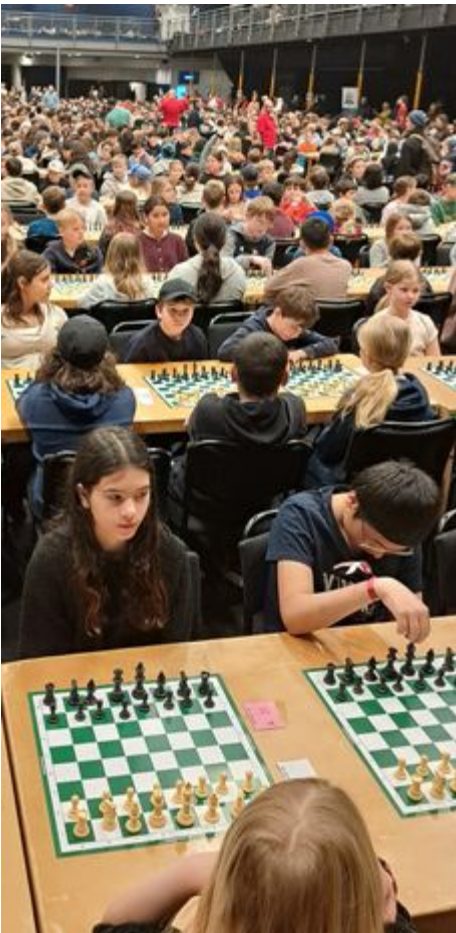
Schackfyran, 16-17 April 2026, Stockholm (Sweden)

Each year, around 25,000 fourth-grade students from over 1,000 classes take part, making it one of the largest chess competitions in the world, organised by the Swedish Chess Federation. Since its launch in 1978, it has