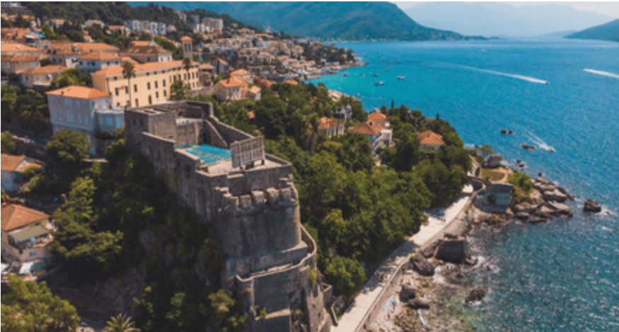
Herceg Novi, Montenegro to host European Open and Women's Chess Club Cups 2026

European Chess Union (ECU) and Montenegro Chess Federation (MCF) have the honour to invite all the National federations affiliated to ECU to participate in the 41st European Chess Club Cup and the 30th European Chess Club Cup for Women. The events will be held in Herceg Novi, Montenegro, from 16th October (arrival day) to 24th October 2026 (departure day).