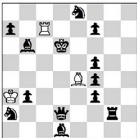
A helpmate-in-3 with four solutions from 31st Dutch Championship

Typical helpmate with a white pawn on the 7th rank. Four variations, one for every possible promoted piece.