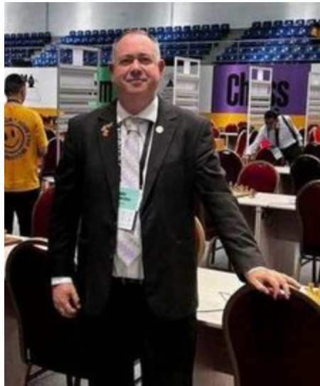
Text by IA Alon Shulman Councilor of ECU Arbiters Council

Try and have the top arbiters on the top boards and assign them fewer boards than the arbiters in the lower sections. Many arbiters in a utopia. In most cases as CA you would be assigned fewer arbiters than you would like. This is what you have and with this you need to prevail.