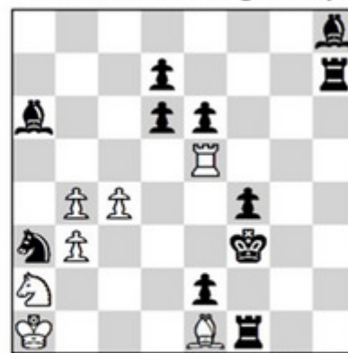
A helpmate-in-3 from Winton British Chess Solving Championship