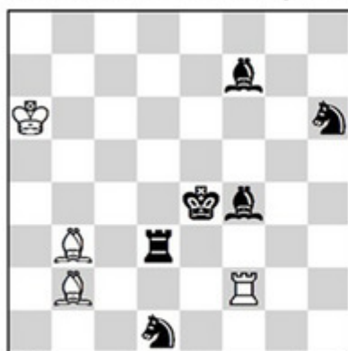
A helpmate-in-2 with four solutions from 47th Finnish Championship